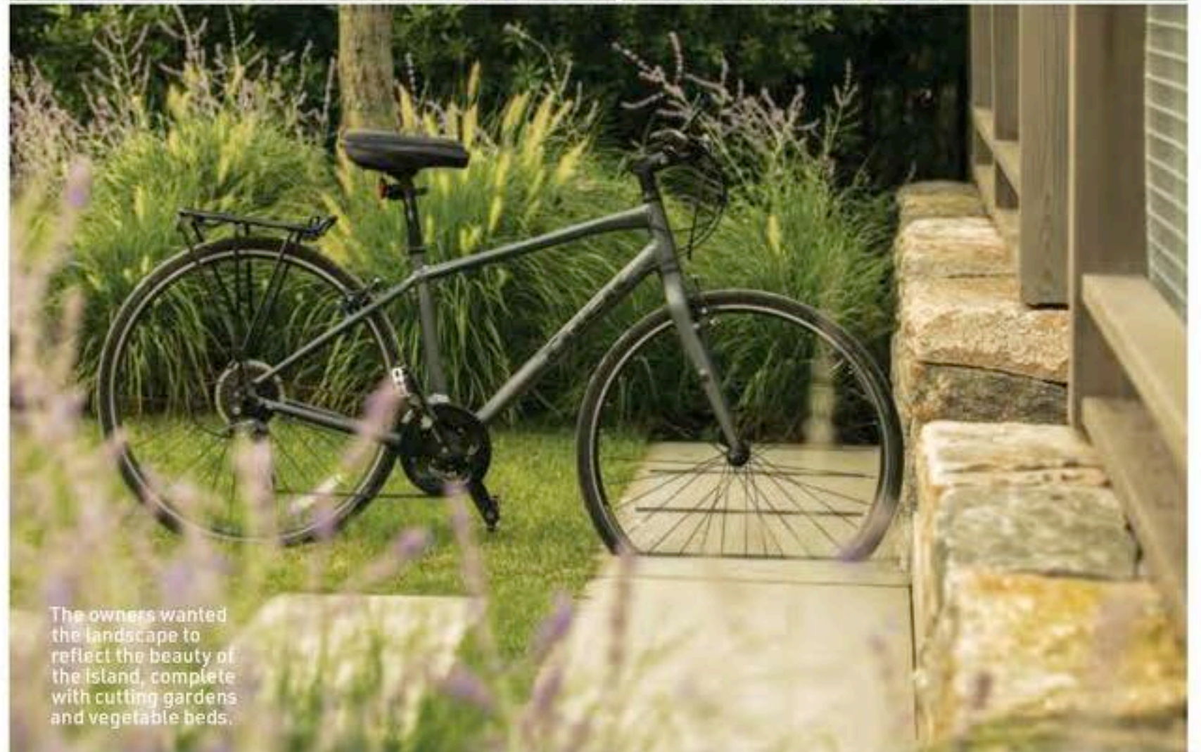
The owners wanted the landscape to reflect the beauty of the island, complete with cutting gardens and vegetable beds.